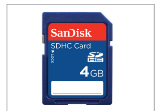
MEMORY CARD FUNCTIONALITY*