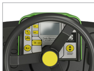
PRESET WORKING PROGRAMS