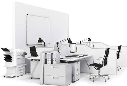
BUILDING SERVICE CONTRACTORS