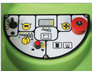
INTUITIVE CONTROL PANEL